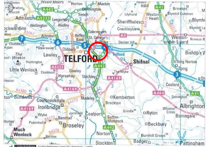
© Collins Bartholomew Limited 2007. Plotted Scale - 1:100000 This map was created with Promap