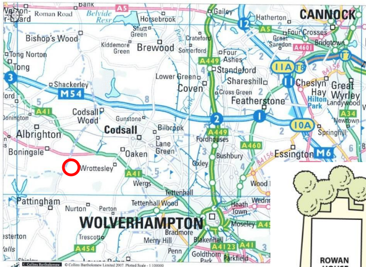
This map was created with Promap