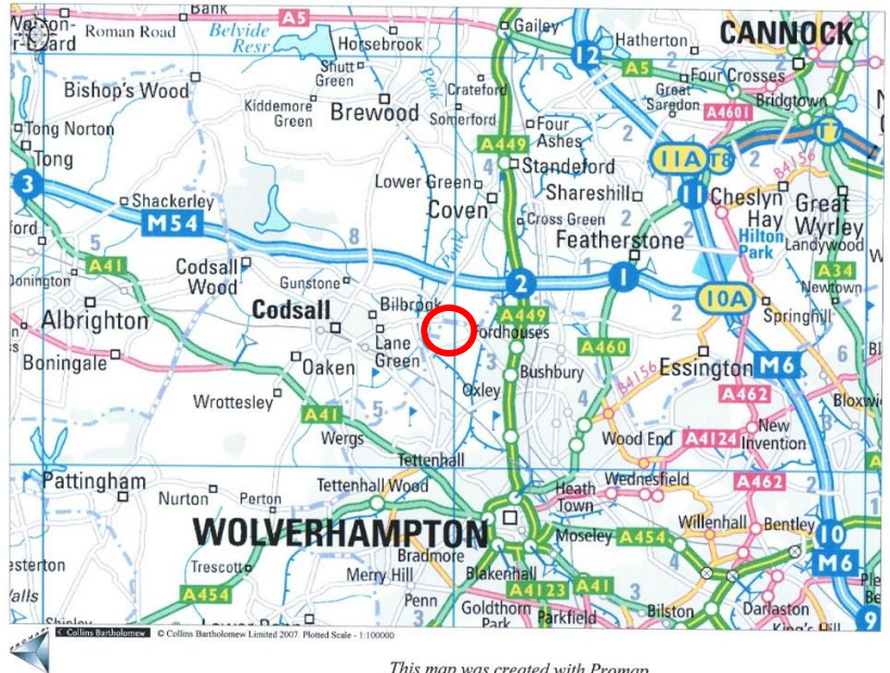
This map was created with Promap

6 Nightingale Place, Pendeford Business Park, WV9 5HD ///fever.amount.lofts